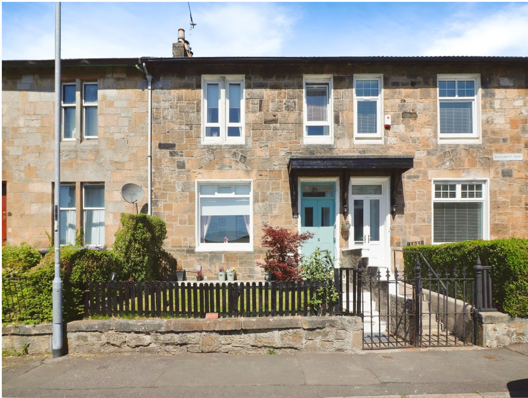
Eastcroft Terrace, Glasgow G21 4NG