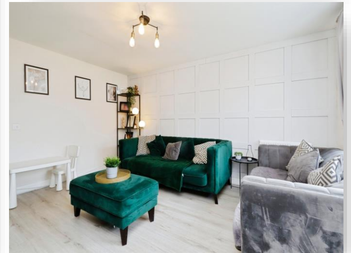
Loubcroy Place, GLASGOW G33 1BZ