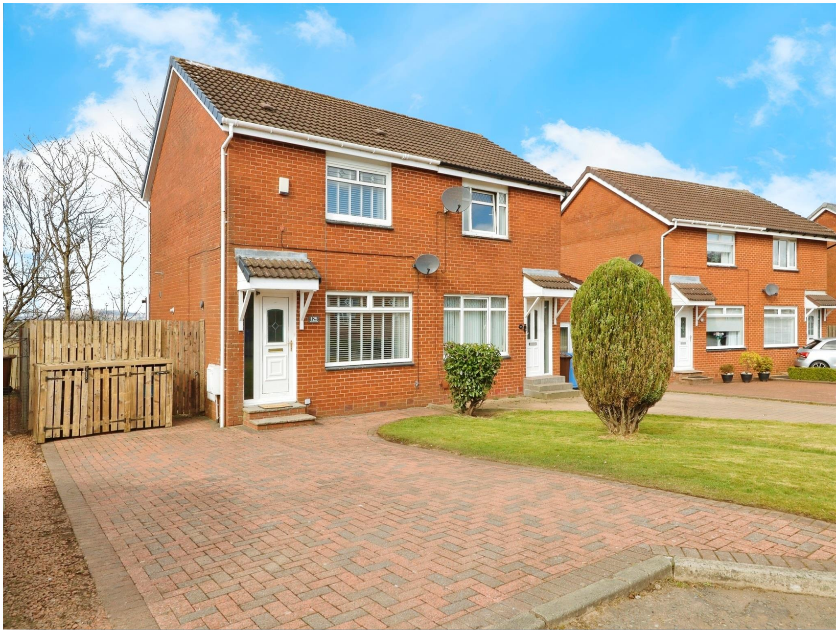
Glenbuck Avenue, GLASGOW G33 1DT