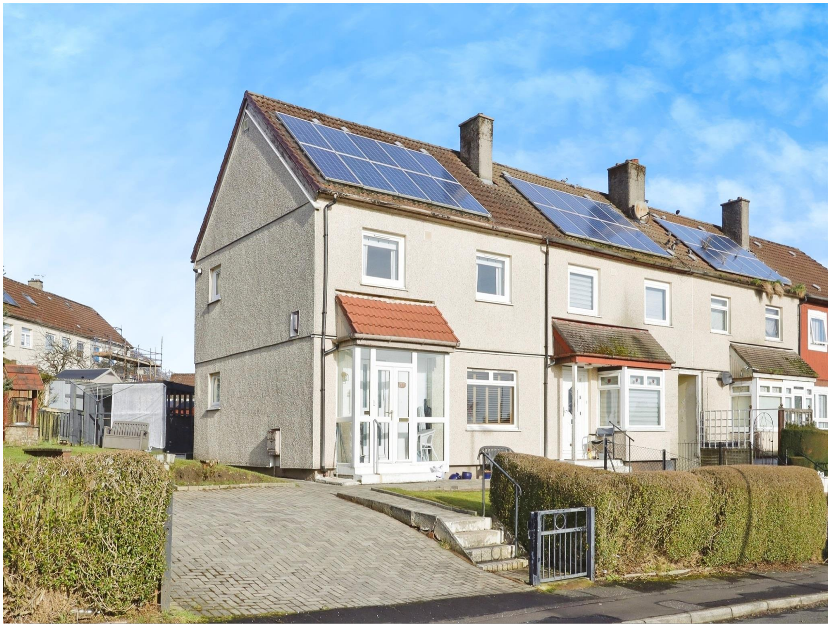
Wallacewell Road, Glasgow G21 3NU