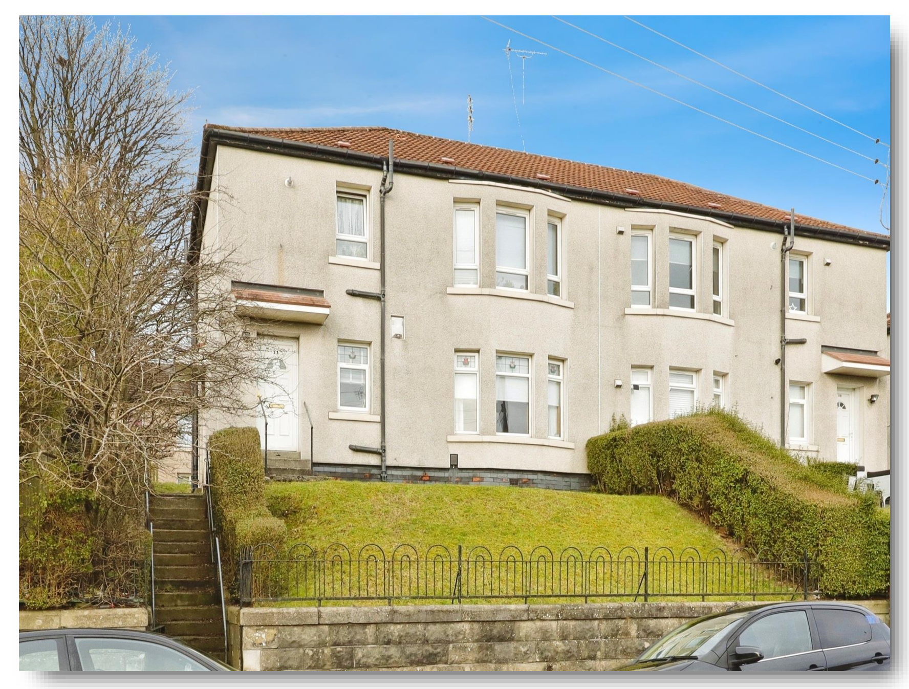
Haywood Street, Glasgow G22 6QE