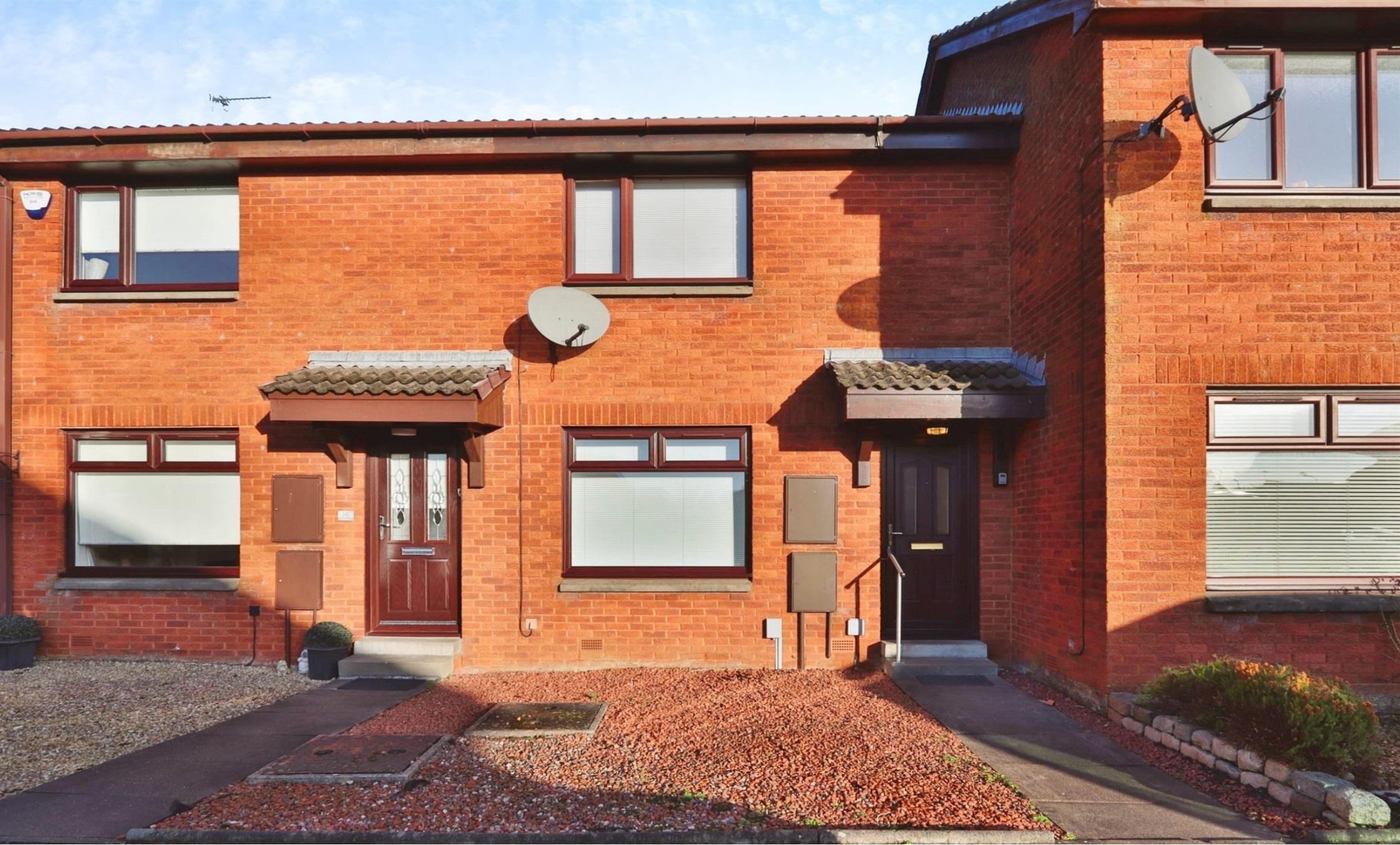
Murrayfield, Bishopbriggs GLASGOW G64 3DS