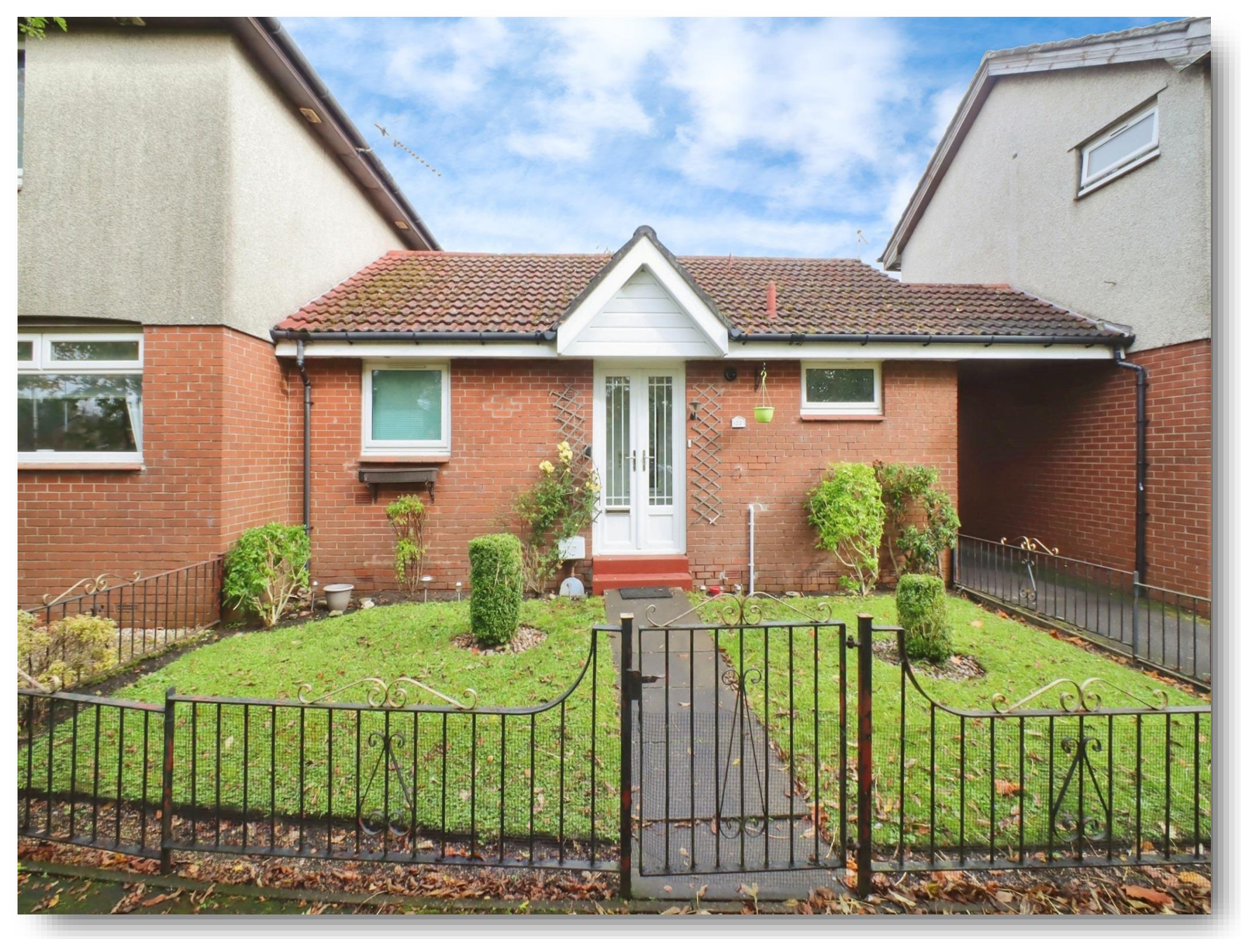
Auchinleck Gardens, Glasgow G33 1PL