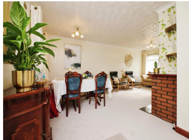
Melville Gardens, Bishopbriggs Glasgow G64 3DE