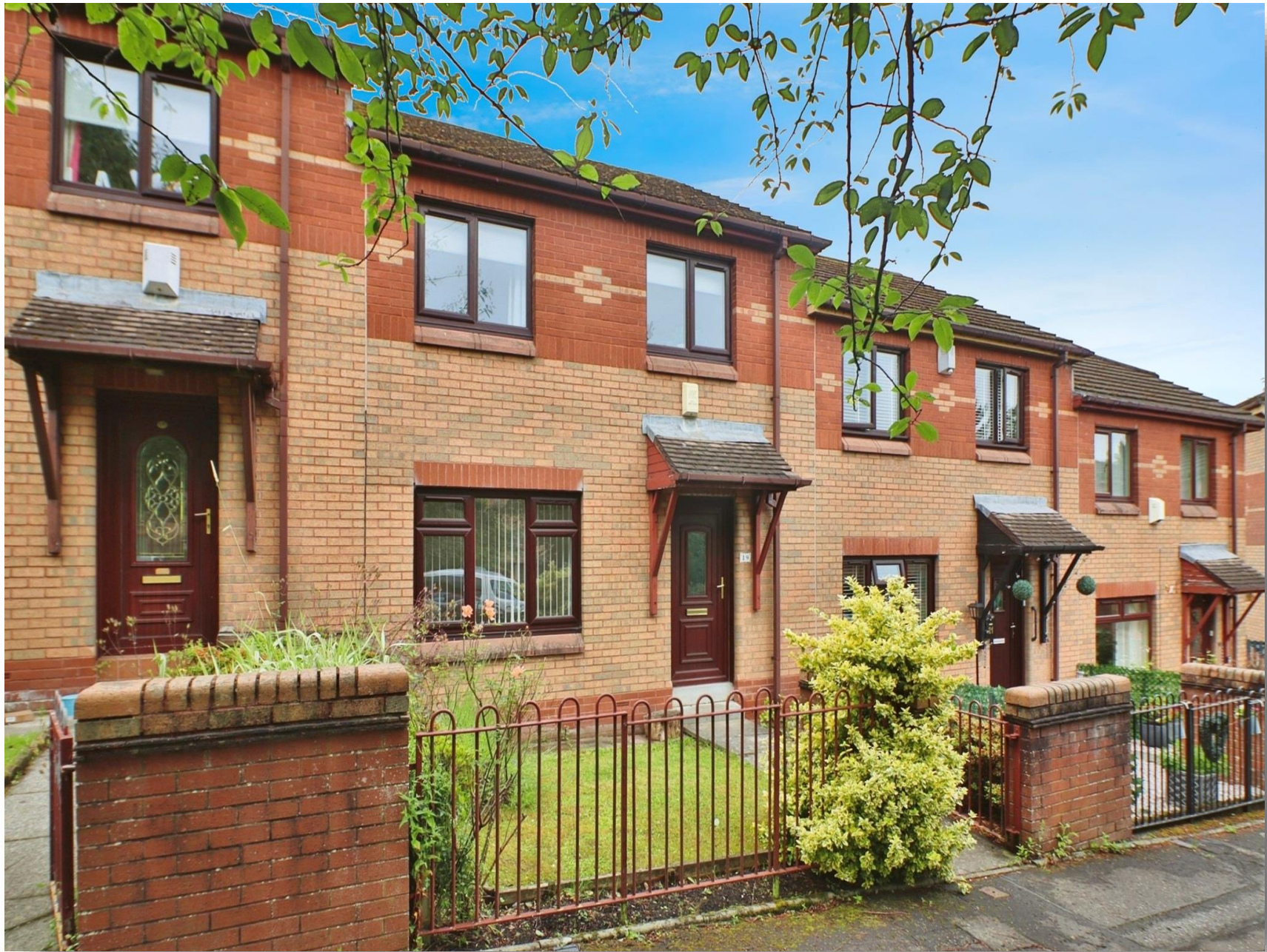
Southloch Gardens, Glasgow G21 4AR