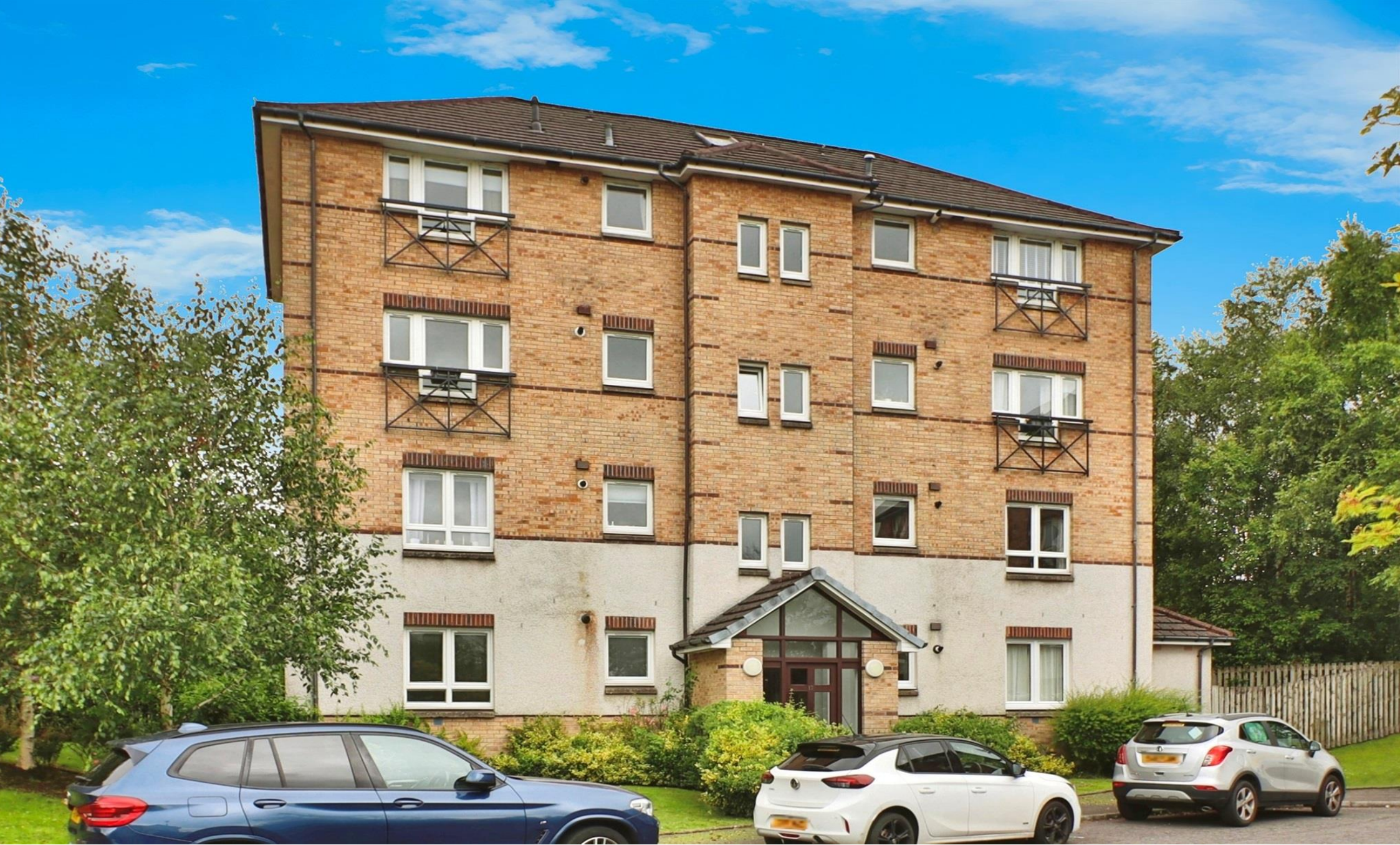
Innellan Gardens, Kelvindale Glasgow G20 0DX