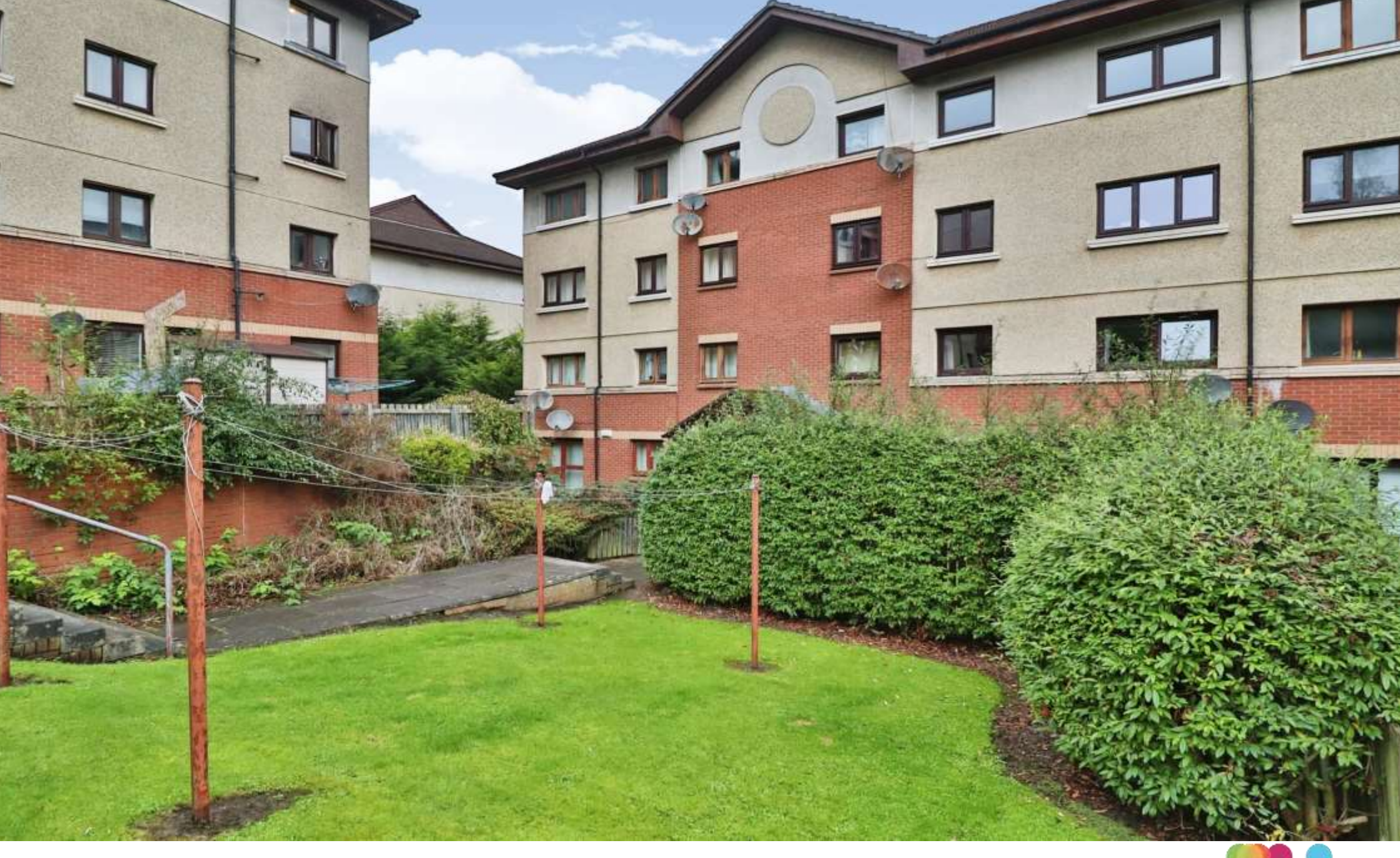
Flat 3/2 Ratho Drive, Glasgow G21 1NA