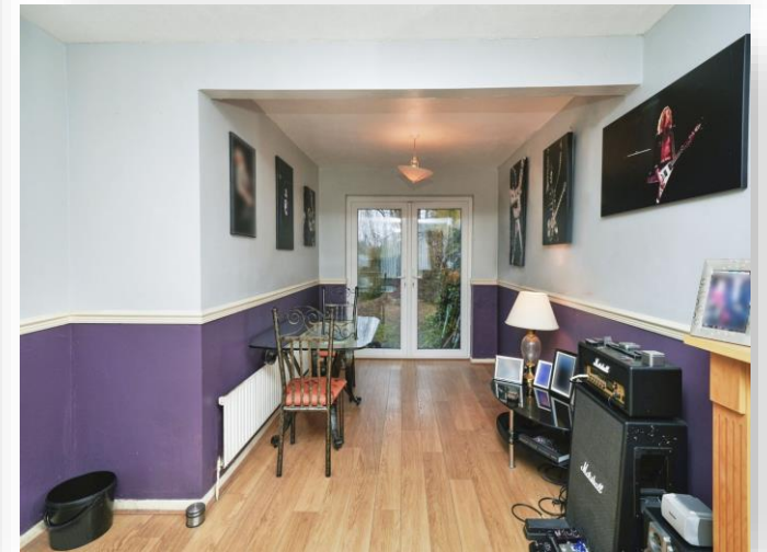
Millhouse Lane, Moreton Wirral CH46 6HN