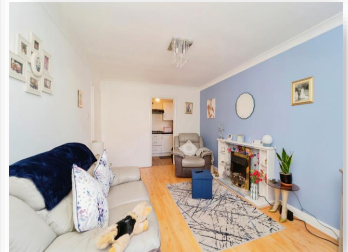
Oak Close, Wirral CH46 0UH