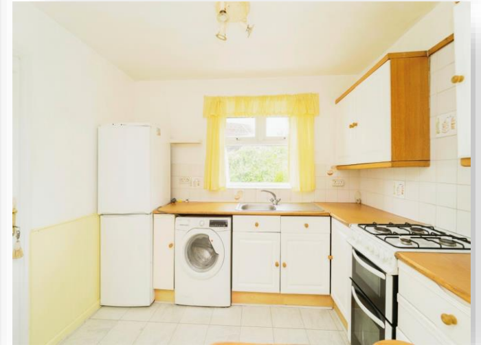
Eastway, Moreton Wirral CH46 8SS