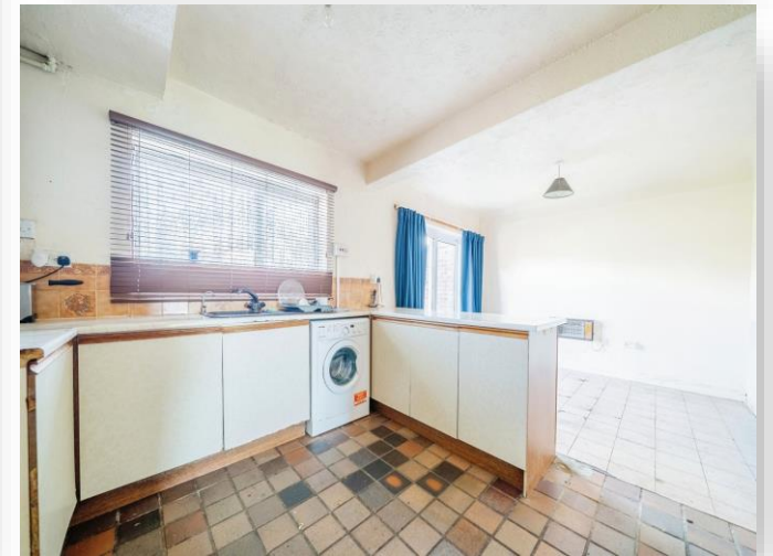
Edgehill Road, Wirral CH46 6AS