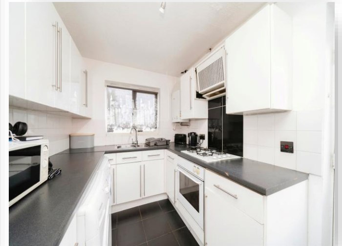
Oakmere Close, Wirral CH46 3RJ