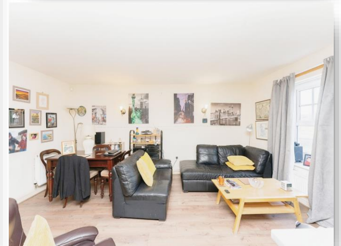
Causeway House, Leasowe Road, Wirral, CH46 3SQ