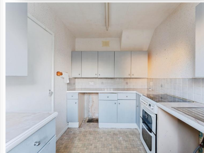
Stoke Gardens, Ellesmere Port CH65 0DR