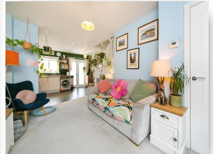
Darwin Row, Ellesmere Port CH65 4DG