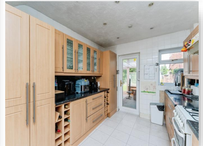
Atherton Road, Ellesmere Port CH65 8HW