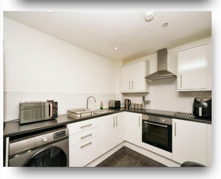
Wings Court Station Road, Little Sutton Ellesmere Port CH66 1NY