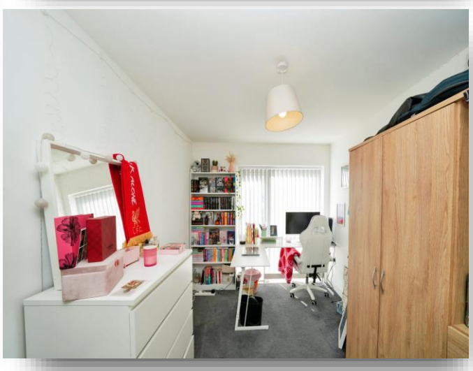
Wings Court Station Road, Little Sutton Ellesmere Port CH66 1NY