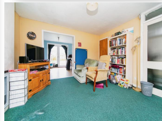
Archers Way, Great Sutton Ellesmere Port CH66 2RY