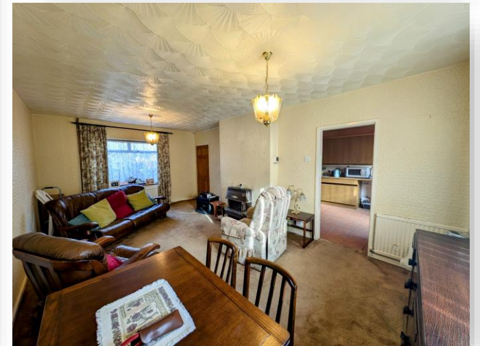
Sutton Way, Great Sutton Ellesmere Port CH66 4RH