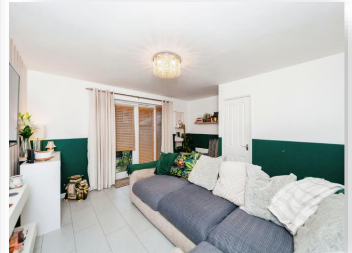
Trinity Road, Ellesmere Port CH65 5FB