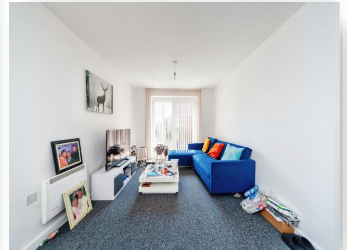
St Johns House Robinson Road, Ellesmere Port CH65 5FH