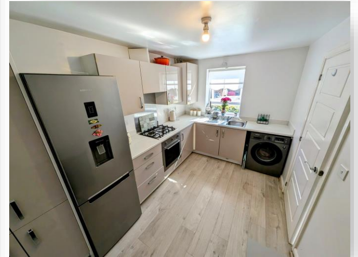
Columbia Road, Ellesmere Port CH65 8AL