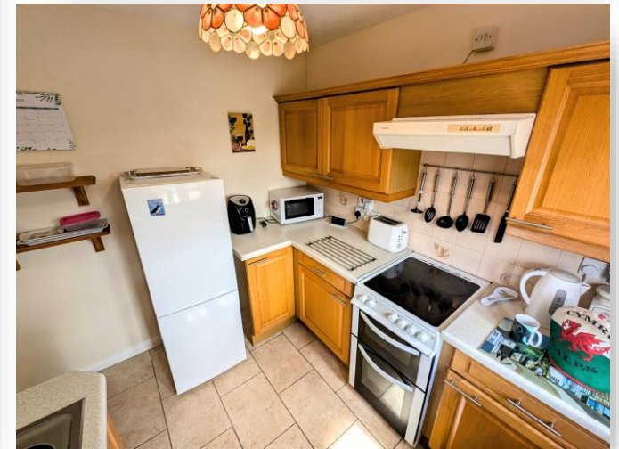
Cygnets Close, Great Sutton Ellesmere Port CH66 3TB