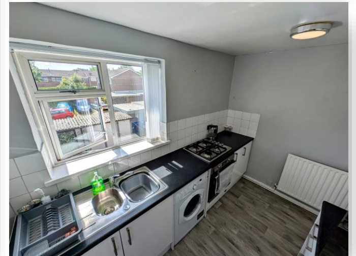
Gowy Court, Ellesmere Port CH66 1RG