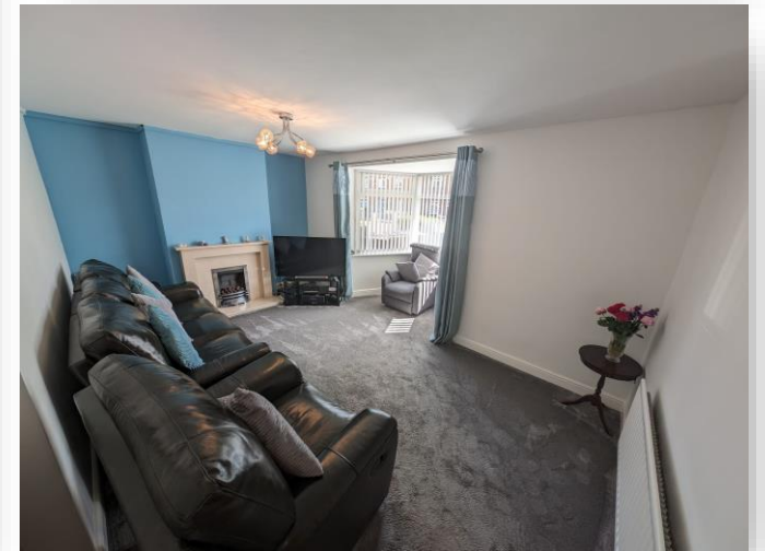
Pound Road, Little Sutton Ellesmere Port CH66 1HT