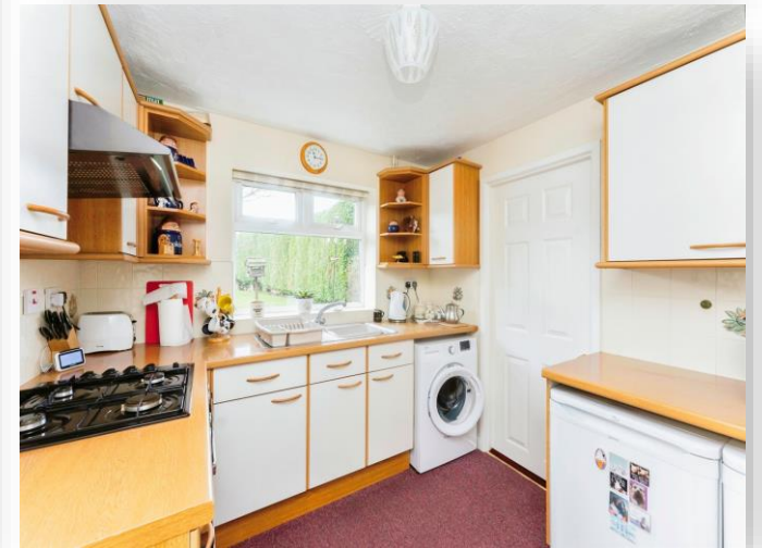
Stanney Lane, Ellesmere Port CH65 9AQ