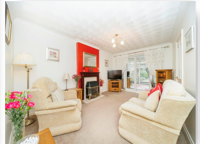
Norman Close, Great Sutton Ellesmere Port CH66 2YE