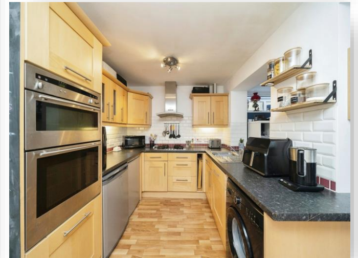
Puffin Close, Ellesmere Port CH65 9JP