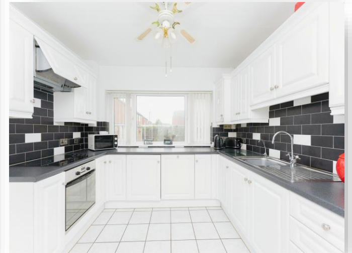
Lancaster Gardens, Ellesmere Port CH65 5ED