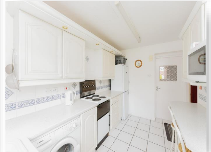
Eastway, Little Sutton Ellesmere Port CH66 1SG