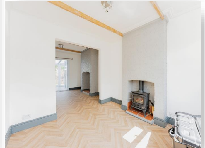
Heath Lane, Little Sutton Ellesmere Port CH66 5NS