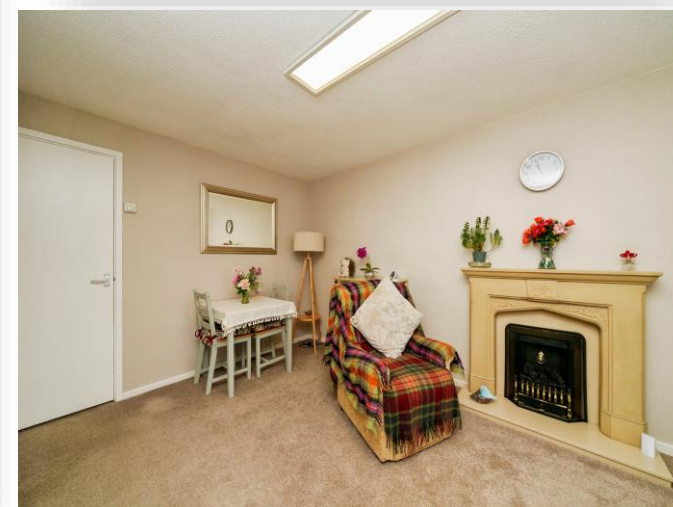
Heathbank Avenue, Wirral CH61 4XD