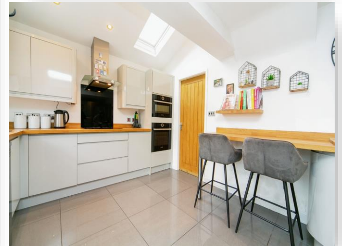
3 Kingfisher Way, Saughall Massie CH49 4PR