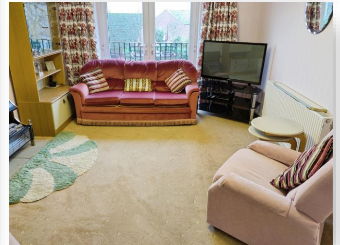
Manor Court, Greasby Road, Greasby Wirral CH49 3NG