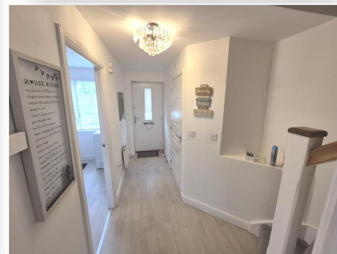
Far Hey Drive, Wirral CH49 4SD