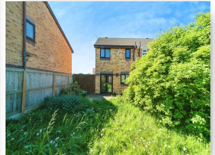
Millhouse Lane, Moreton Wirral CH46 6DT