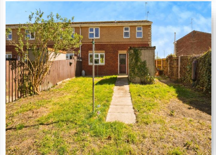
33 Greystoke Close, Upton Wirral CH49 0UH