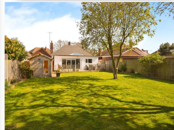
Leaway, Greasby, Wirral CH49 2PY