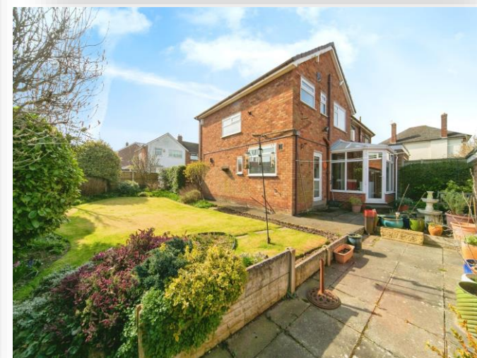
8 Eltham Close, Wirral CH49 5NL