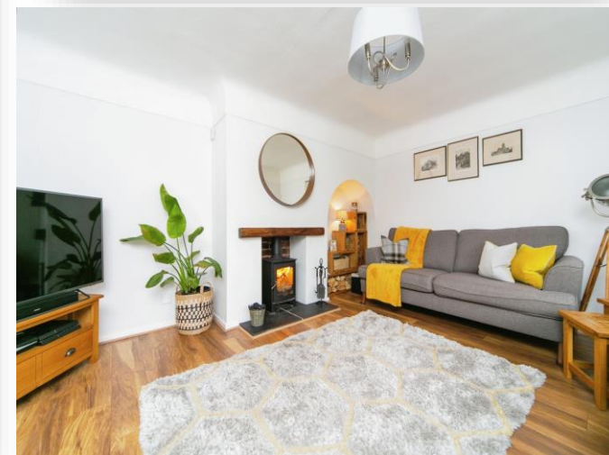
Wood Lane, Greasby Wirral CH49 2PX