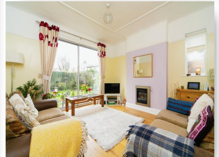
4 Howell Drive, Greasby CH49 1RX