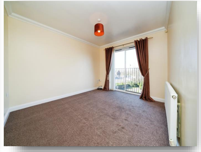
Flat 8 Manor Court, 114 Greasby Road, Greasby, CH49 3NG