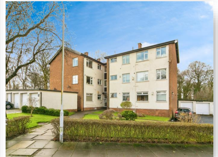
Arrowe Court, Wirral CH49 5NF