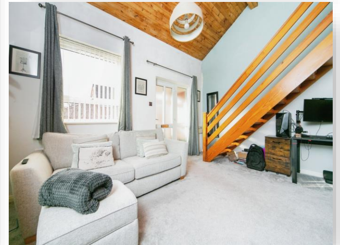
Thornham Close, Upton, CH49 4GE