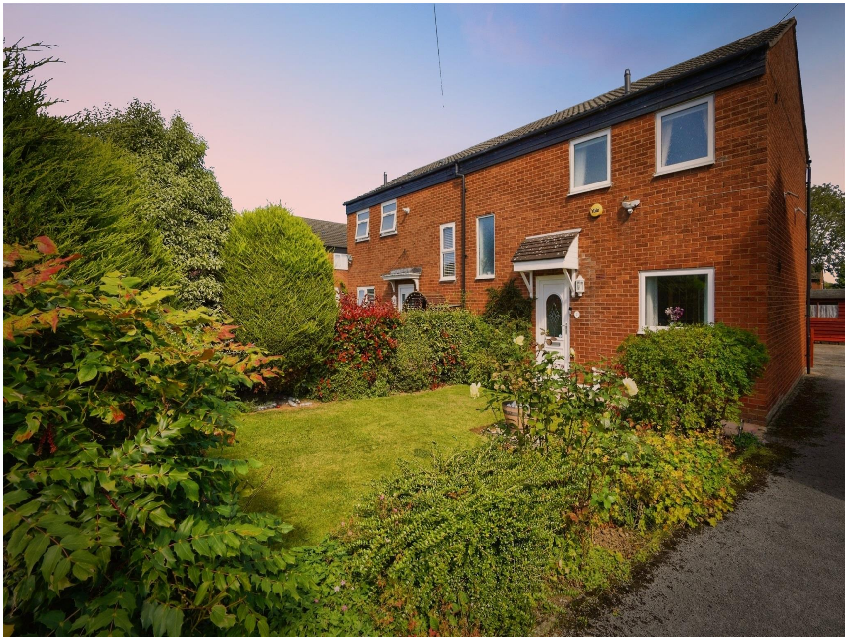
Kentmere Drive, Pensby Wirral CH61 5XN